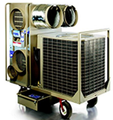
AIR COOL/HEAT/UVGI FILTRATION (1) F-EMAT5T