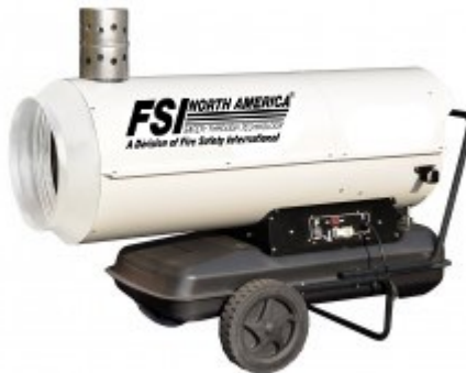
OIL INDIRECT FIRED 285,000 BTU AIR HEATER (1) F-HVF3101