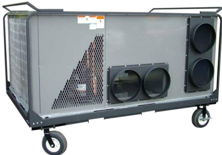
DUAL HEAT/COOL (1) F-DI100HP0100CM