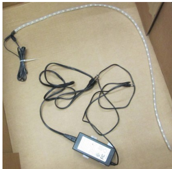
(3) F-SFLL-5M (3) F-SFLLPS-12V