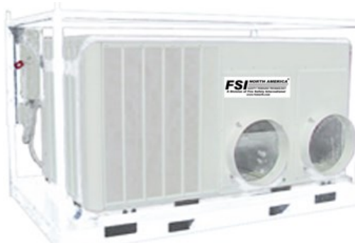
126,000 BTU AIR CONDITIONER (1) F-MOB-10TAC