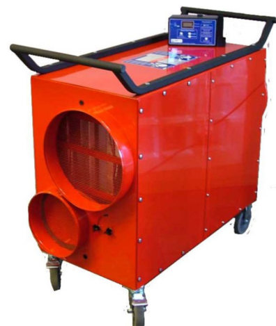
HEPA AIR CARBON FILTER UNIT (1) F-PASS1600-IU