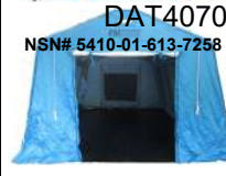
DAT4070 NSN# 5410-01-613-7258