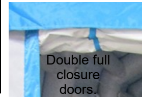
Double full closure doors.

All sizes also available in Isolation (-IS) models. Other sizes available P.O.A. Standard colors are 'FSI Blue'®, white, red, green and tan. Other colors available P.O.A.