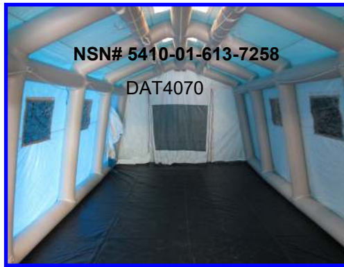
NSN# 5410-01-613-7258 DAT4070