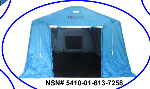
NSN# 5410-01-613-7258 DAT4070